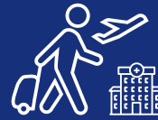
Group PA & Travel